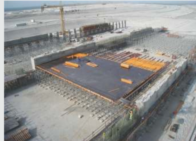
Saadiyat Expressway - UAE