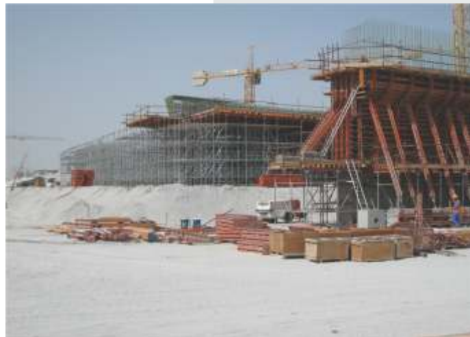
Saadiyat Expressway - UAE