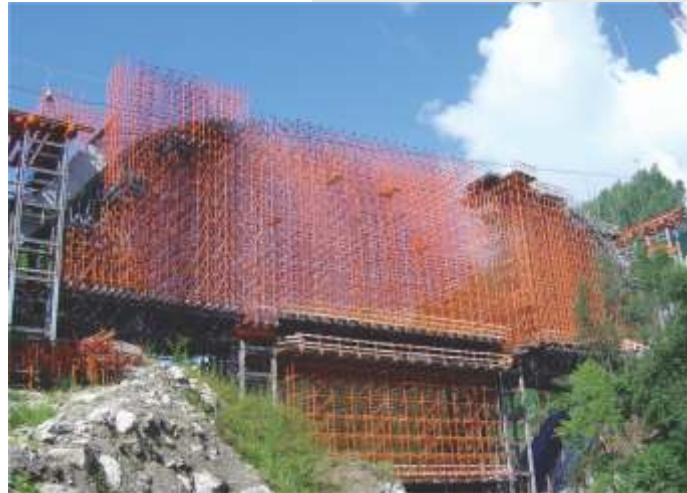
Sa Machado Bridge - Spain