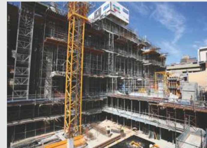
Raine Square - Australia

Thanks to our professional experience and the valued experiences of our partners and suppliers, we are capable in offering you the right solution for all common structures: