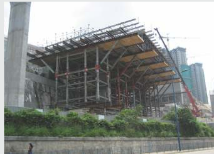
Choi Wan Road / Jordan Valley Bridge - Hong Kong