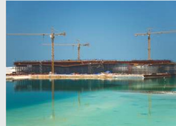
Saadiyat Expressway - UAE